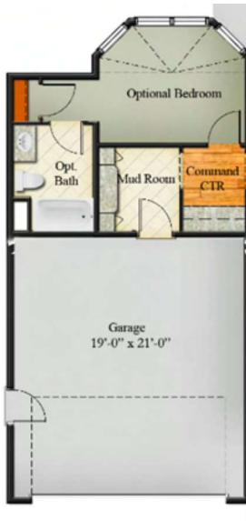
Optional 1 st Floor BR & Bath